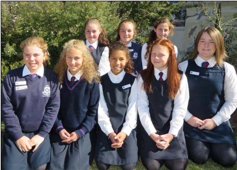
Premier's Debating Challenge Team

Next K-6 Assembly Friday 22nd August 9.30am School Hall All welcome