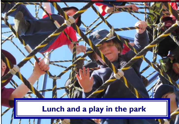
Lunch and a play in the park