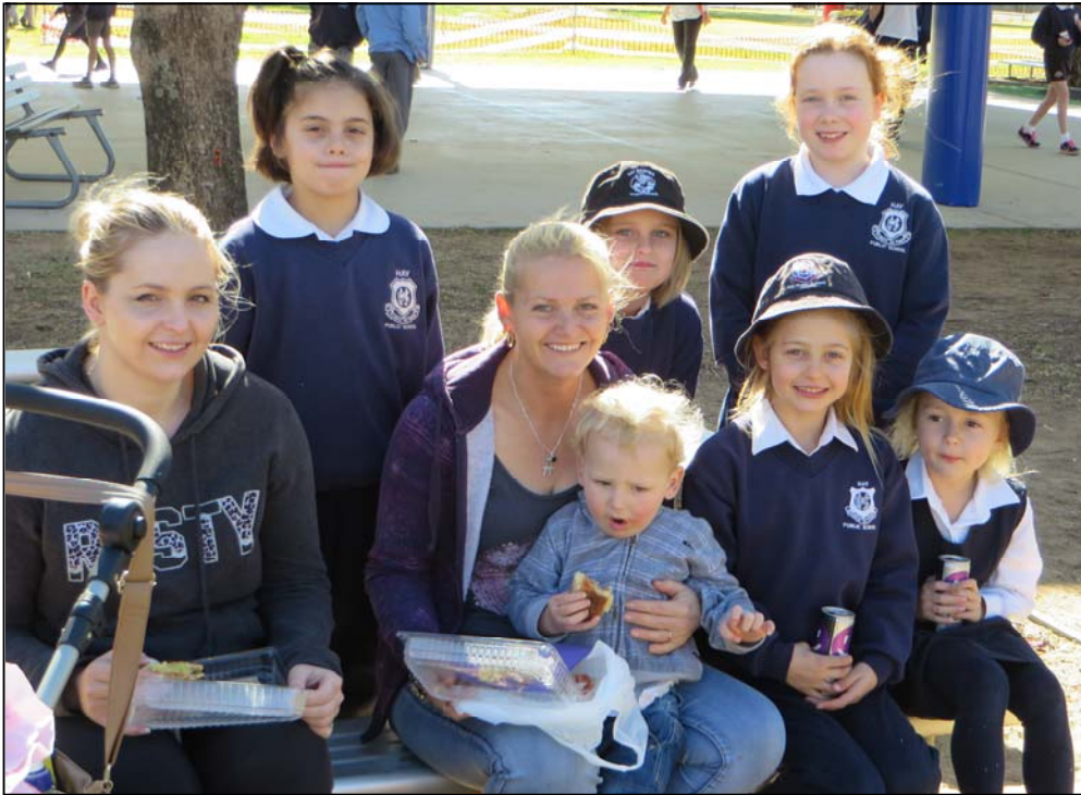
Education Week 2014

Next K-6 Assembly Friday 8th August 9.30am School Hall All welcome