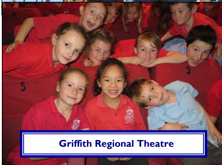
Griffith Regional Theatre