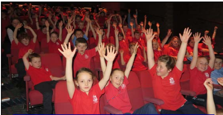
Mr McGee and the Biting Flea