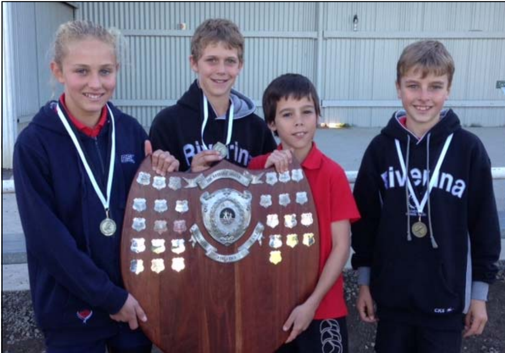
The shield returns to HPS for the 10th consecutive year!