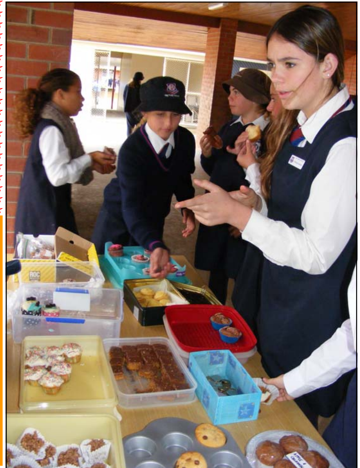
Parliamentarian Cake Stall Thank you to all students and parents who baked for our cake stall. Photo shows our Year 6 Parliamentarians serving at their cake stall on Monday. All fundraising goes towards the Year 6 Farewell.