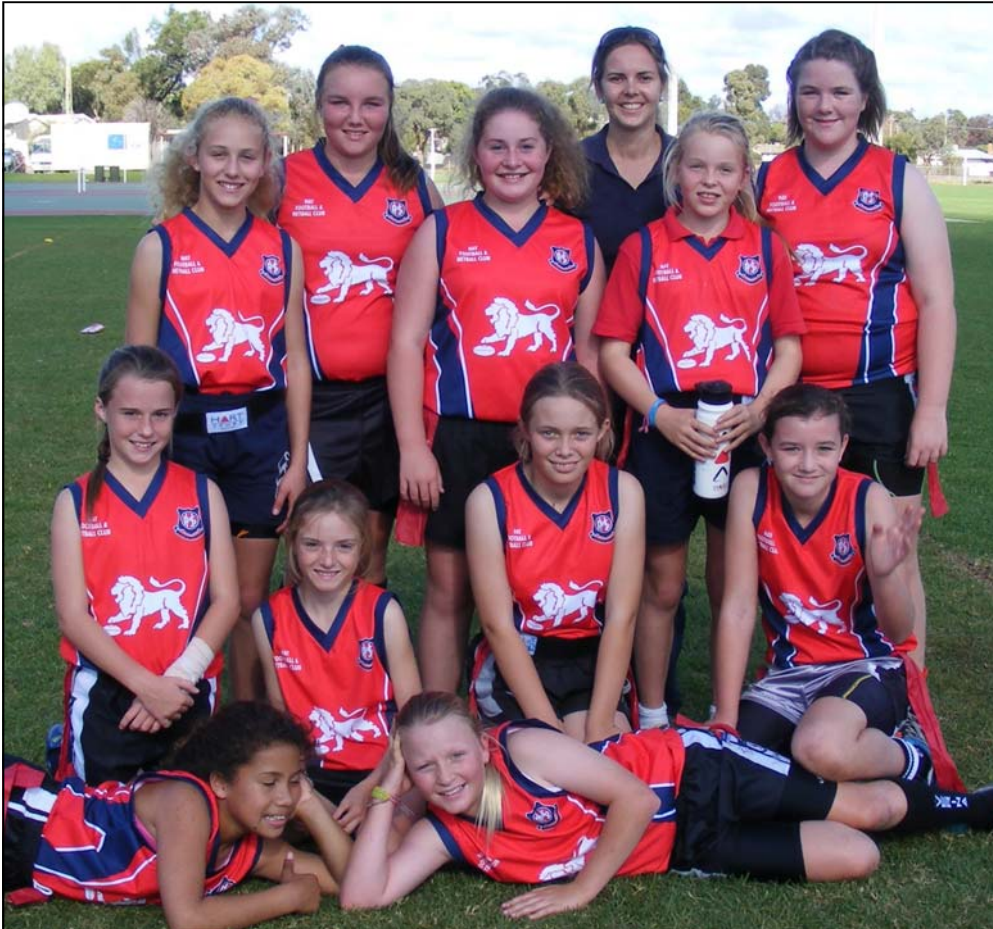
'Winners are Grinners'

Next K-6 Assembly Friday 13th June 9.30am School Hall Athletics Carnival Awards All welcome