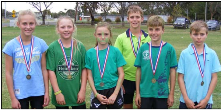
Individual Athletic Champions