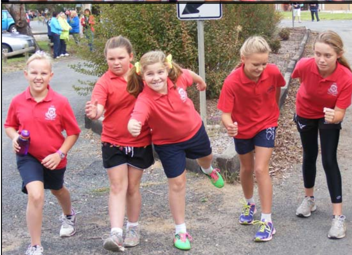
Ready, Set, Go