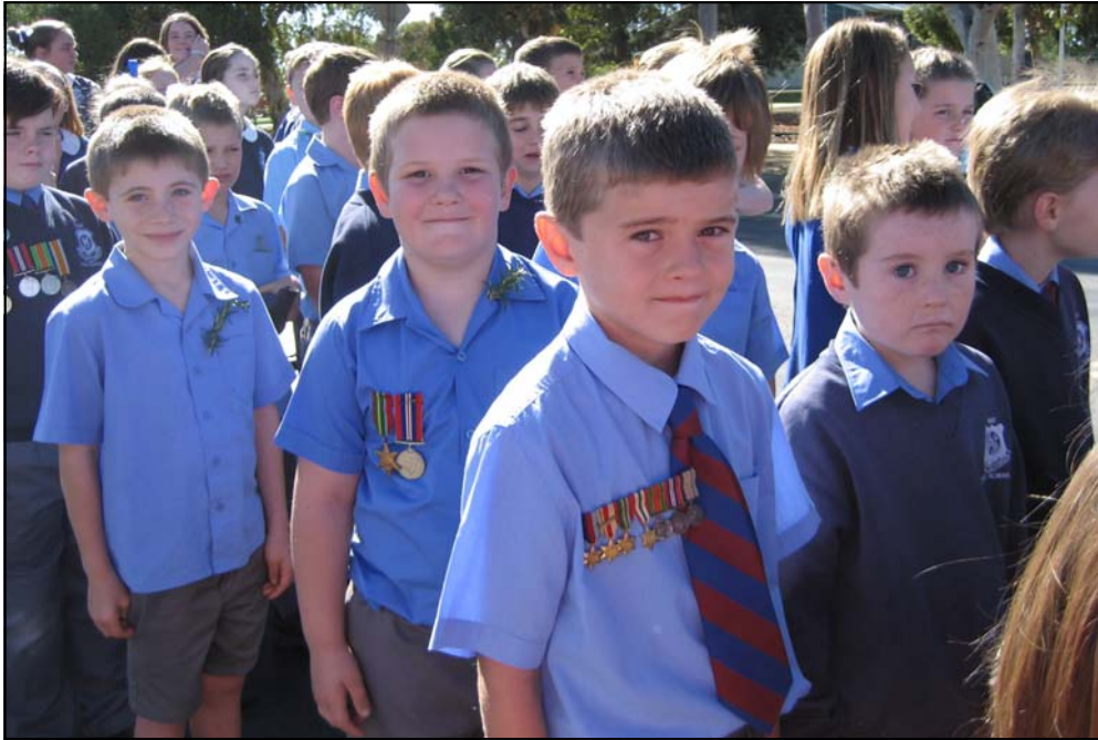
Anzac Day 2014

Assembly Friday 2nd May 9.30am School Hall All Welcome