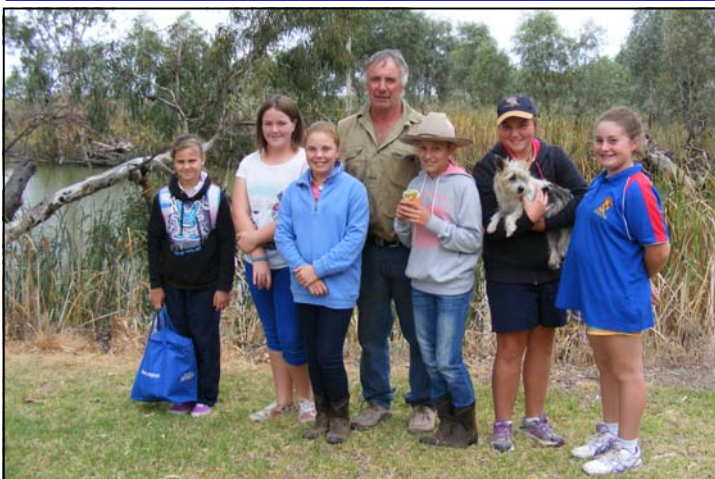
Creative Kids- Writing Group