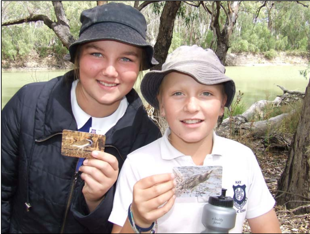
Why Wetlands? Stage 3 Field Trip