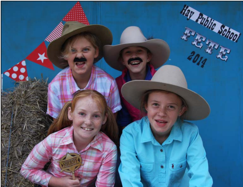
Hay Public School Cowgirls

NO Assembly this Friday 11th April Happy Holidays