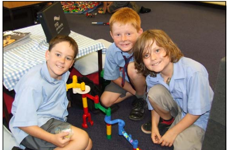
Stage 2 enjoys working creatively.