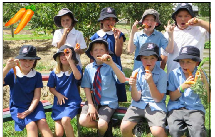
Enjoying the produce of our garden