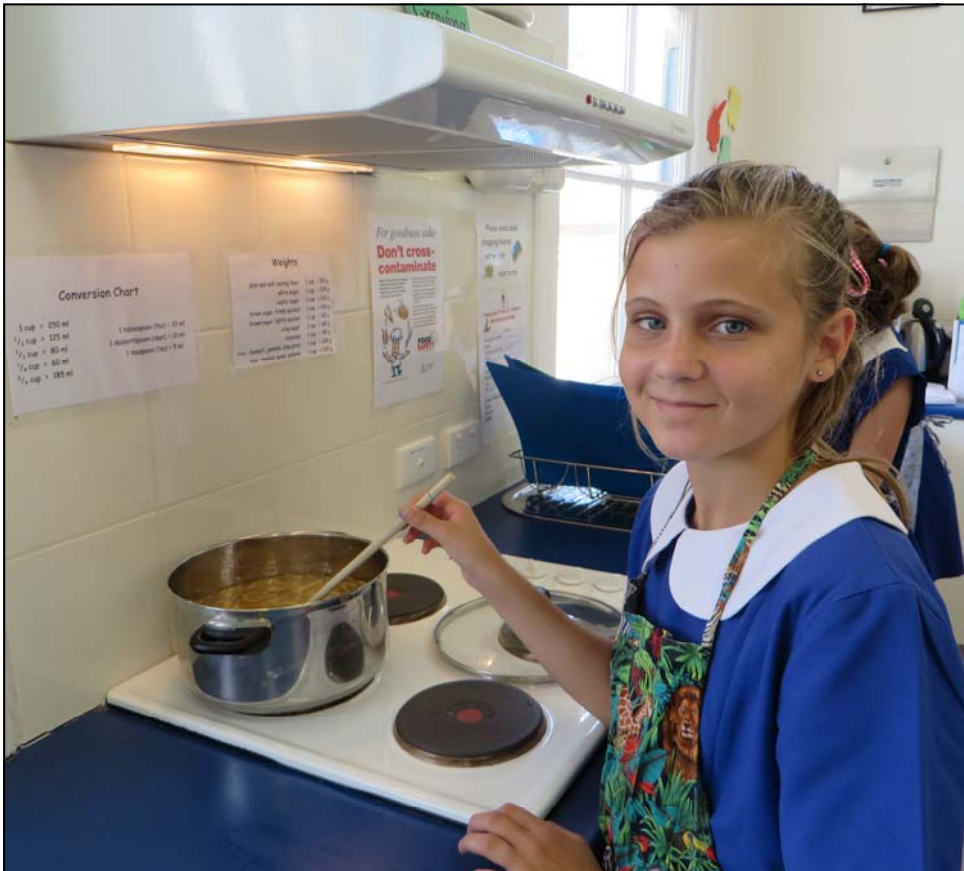
Making jam for the school fete.

K-6 Assembly Friday 14th March 9.30am *Note new time* District Swimming Carnival Awards All welcome