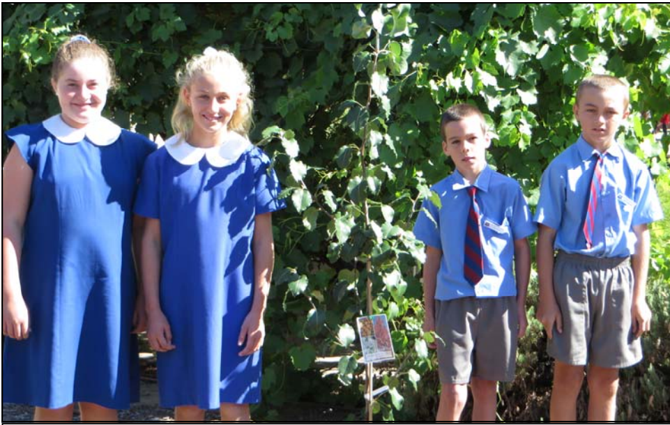
School Captains for 2014