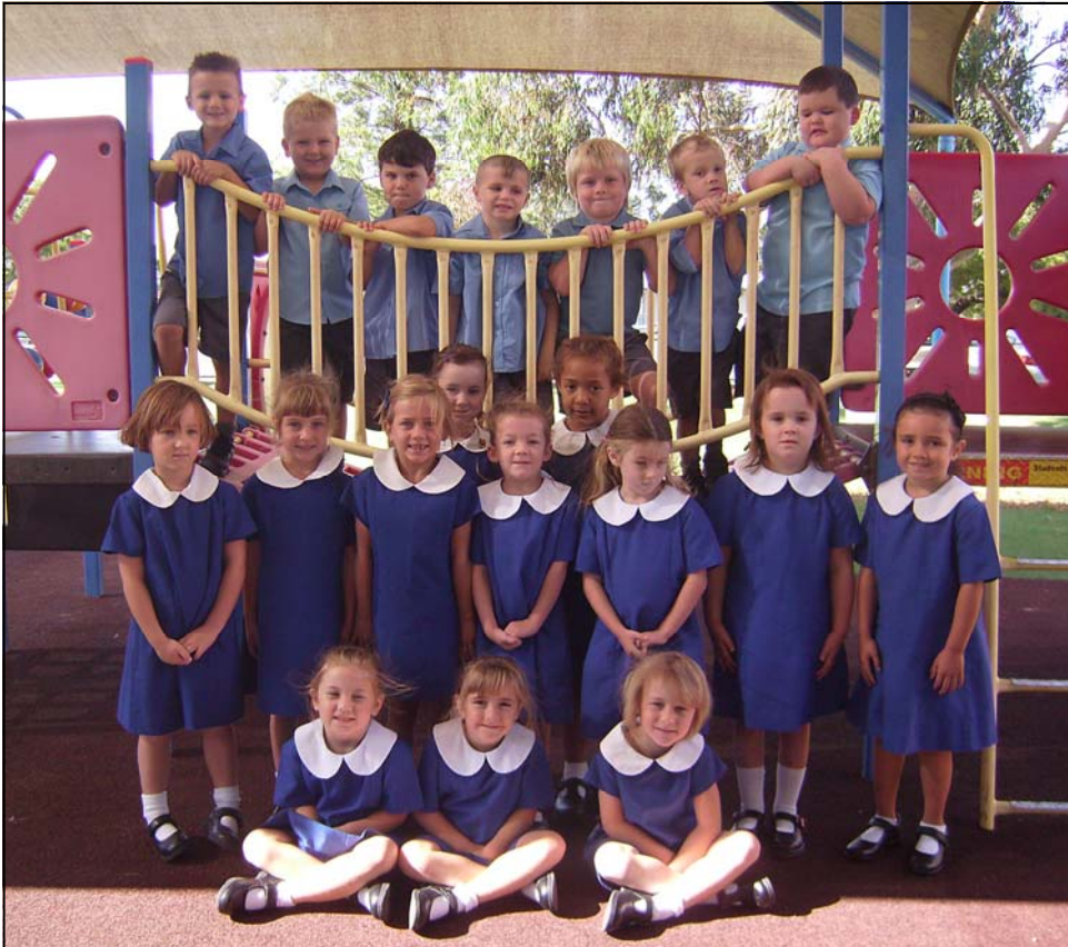
Welcome Kindergarten 2014