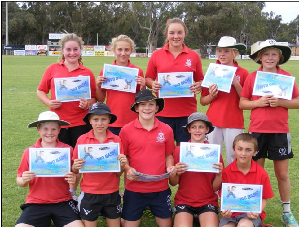
Big Bash Super 8's Winners

K-6 Assembly Friday 5th December 9.30am School Hall All welcome Last school assembly for 2014