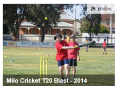
Milo Cricket T20 Blast - 2014