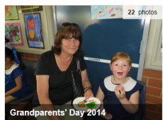
Grandparents' Day 2014