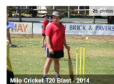
Milo Cricket T20 Blast - 2014