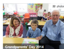
Grandparents' Day 2014