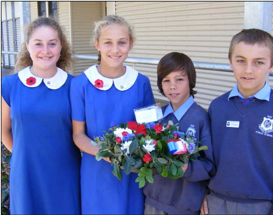
Remembrance Day 2014