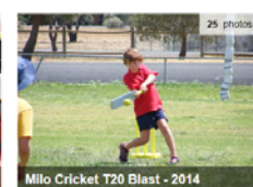
Milo Cricket T20 Blast - 2014