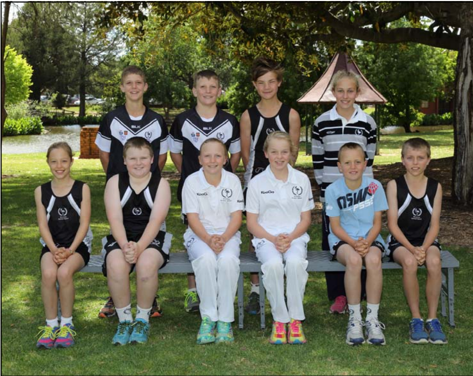
Hay Public School and SOTA District Representatives