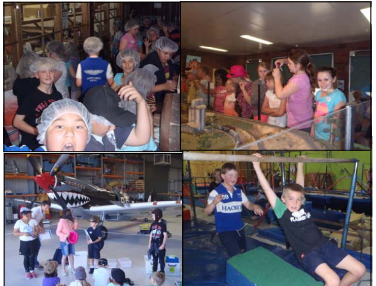
Clockwise, Junee Licorice Factory, Round House Museum, Temora Aviation Museum and the Airborne Gymnastics Centre.