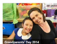
Grandparents' Day 2014