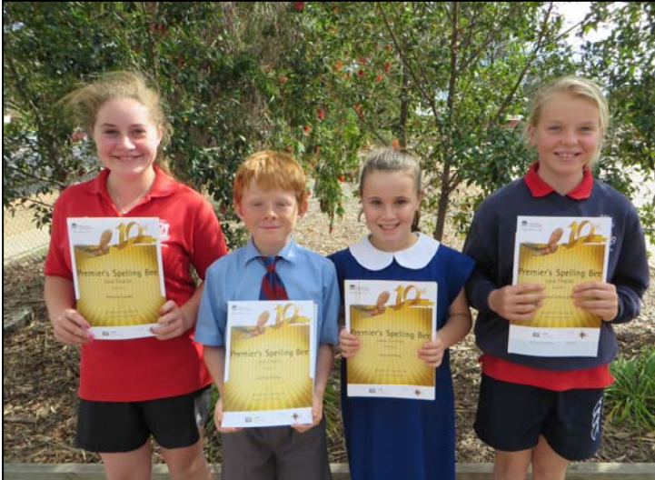
Spelling Bee - Local Finalists

Students have received this week an itinerary and list of requirements for the excursion. Please note : ALL STUDENTS MUST PROVIDE A SLEEPING BAG AND PILLOW.