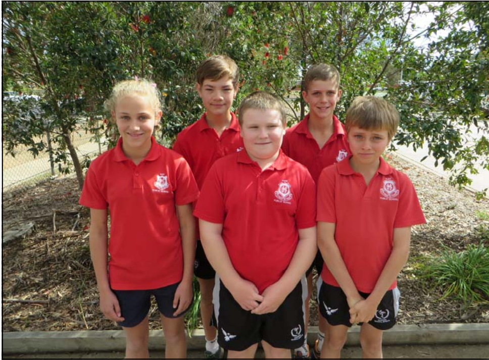
Riverina Representatives—State PSSA Athletics

K-6 Assembly Friday 24th October 9.30am School Hall All welcome