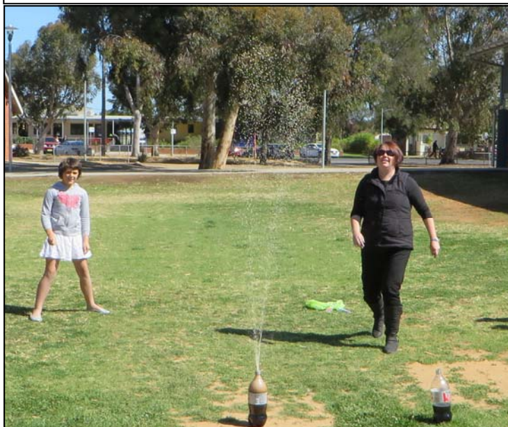
3/4S – There she blows!