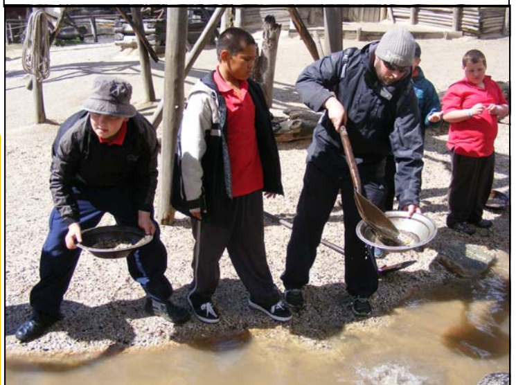
Sir, is there gold in that there pan?

Wednesday 15 th October to support the local branch of the Royal Far West. The Royal Far West is a very strong supporter of children from Hay Public School. All children are encouraged to bring a gold coin donation to help raise funds for this very generous organisation.