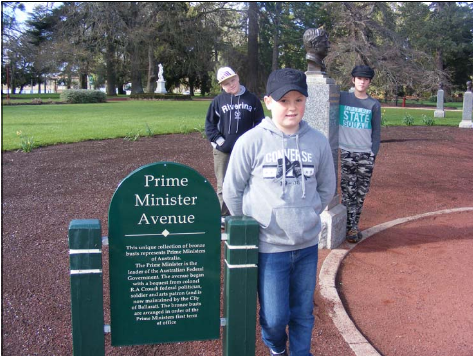
Australia's next Prime Ministers?

K-6 Assembly Friday 10th October 9.30am School Hall All welcome