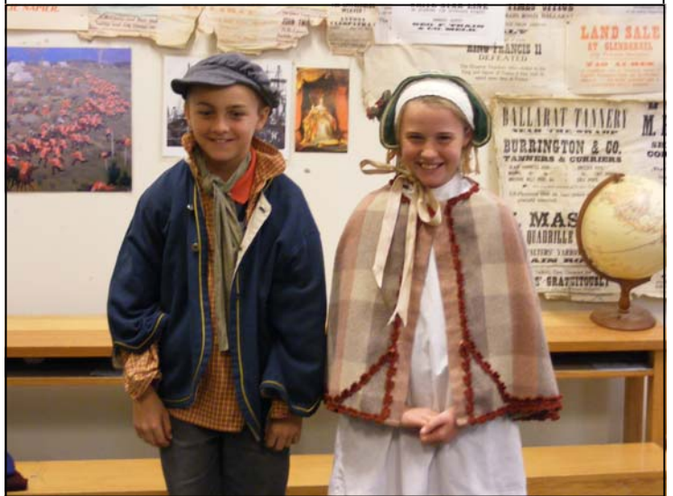
Period costume fun