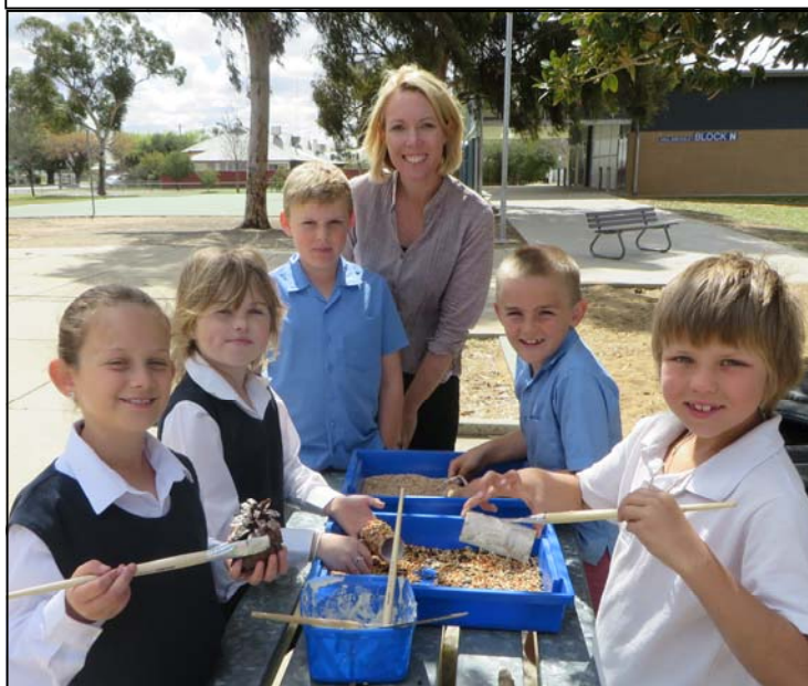
3/4RH – Bird Feeders