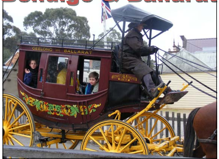
Home Charles and don't spare the horses!!!