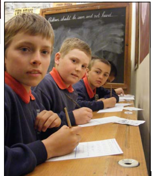
Children should be seen and not heard.... Stage 3 Excursion to Bendigo & Ballarat

A calendar of events for this term is enclosed in this newsletter. It is an 11 week term with students finishing their school year on Wednesday 17th December. Please note the important dates such as Presentation Day (16 th December), Swimming School (24 th November – 5 th December) and Year 6 Farewell (10 th December).