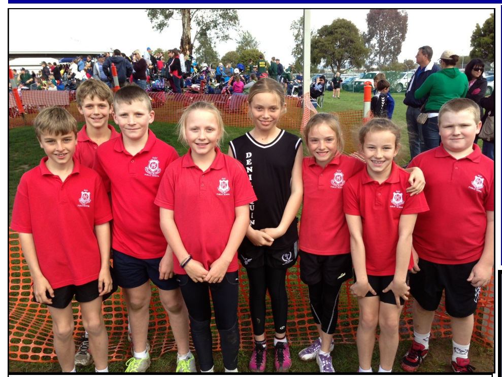
Hay PS Students at Riverina PSSA Athletics