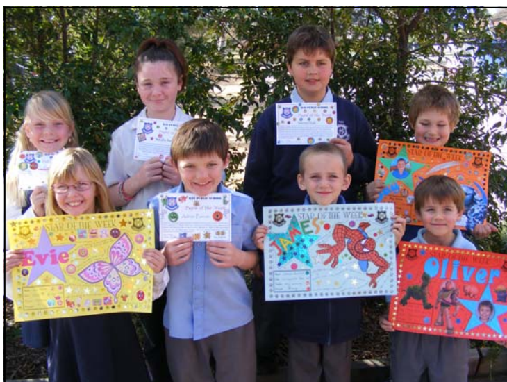
Stars & Pupils of the Week