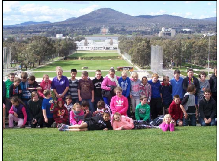
Stage 3 Excursion to Canberra- 2013