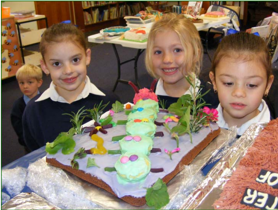
'Bake a Book' for Book Week