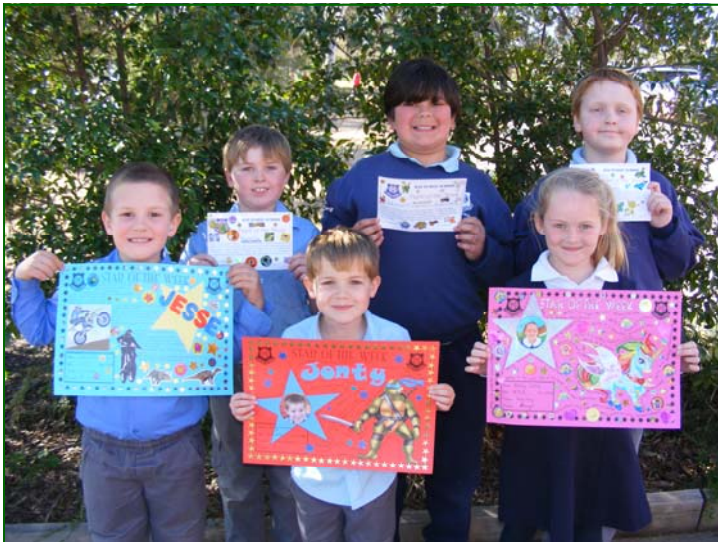
Stars and Pupils of the Week

Assistant Principal Stage 2 & 3 Sports Report