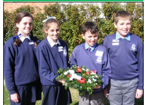
VP DAY Celebrations