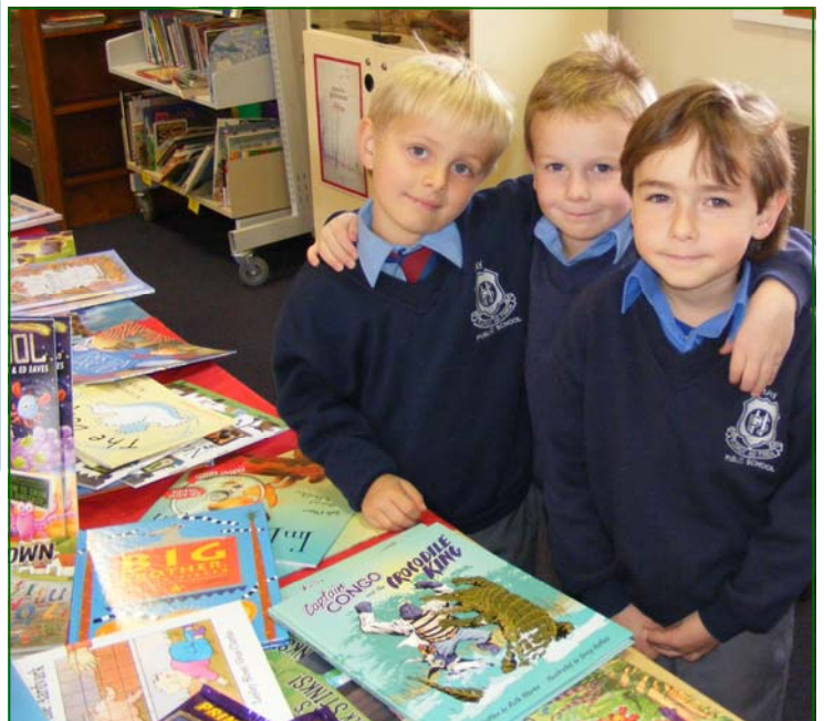
Kindergarten enjoying Book Week in the Library

Final payments for the above excursions are due THIS Friday 23rd August .