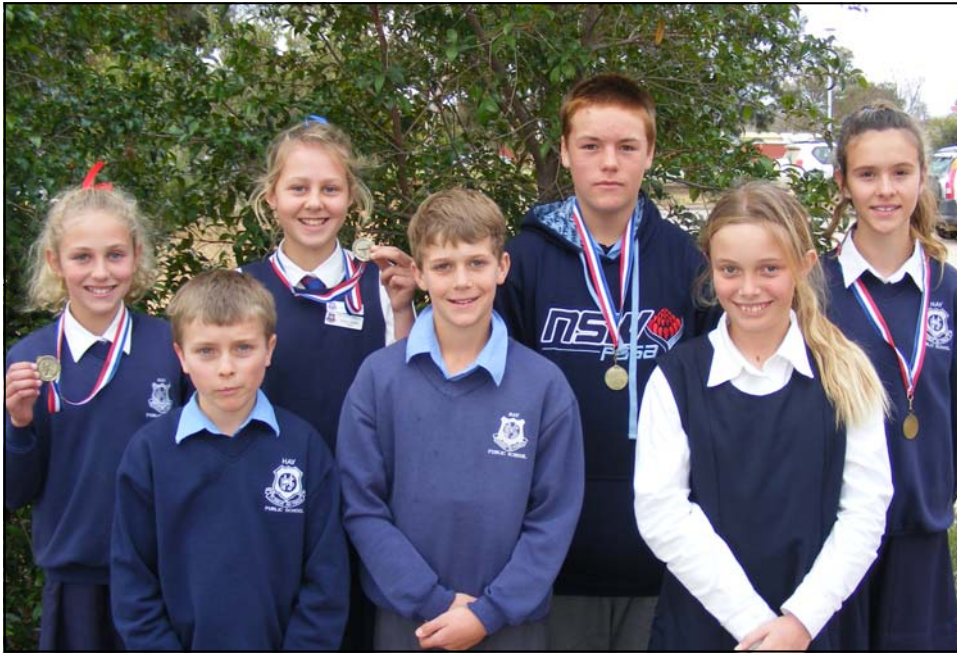
Athletics Carnival Champions