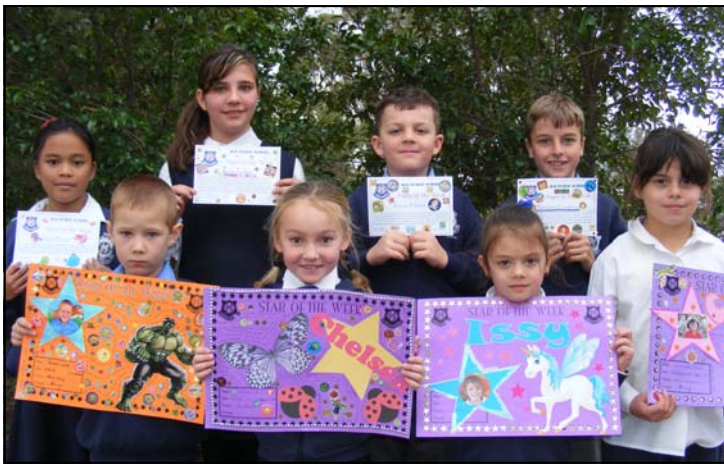
Stars and Pupils of the Week