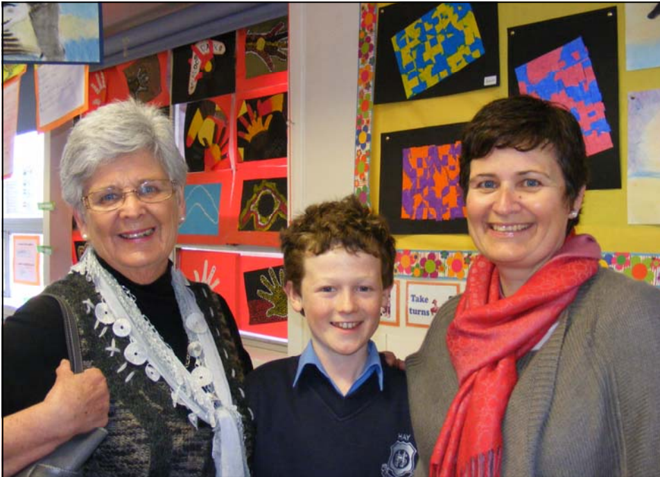
Education Week Open Day 2013