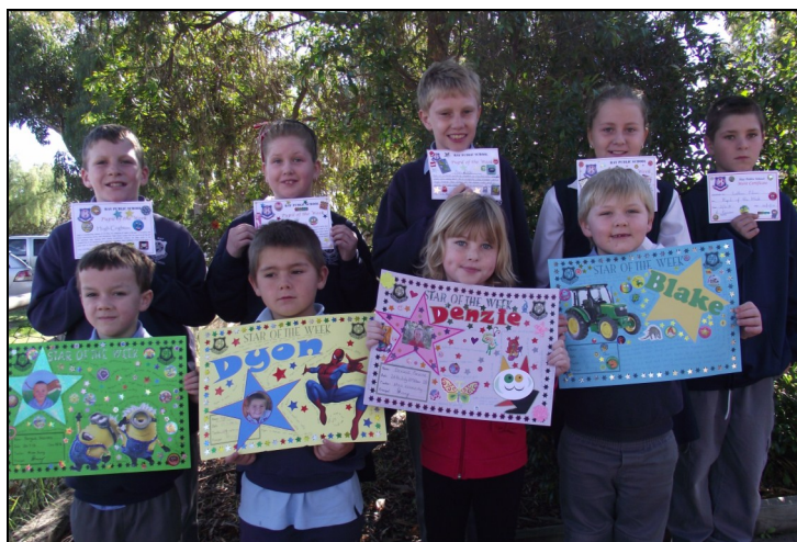
Stars and Pupils of the Week