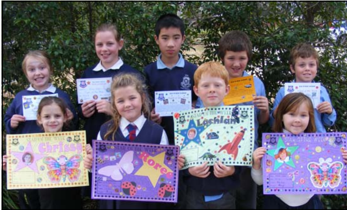
Stars and Pupils of the Week