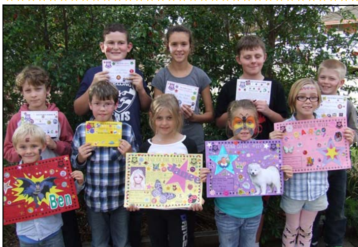
Stars and Pupils of the Week