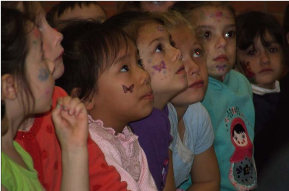
Kindergarten engrossed in the Deadly Australians Performance on our Craniofacial Foundation Fundraising Mufti Day.