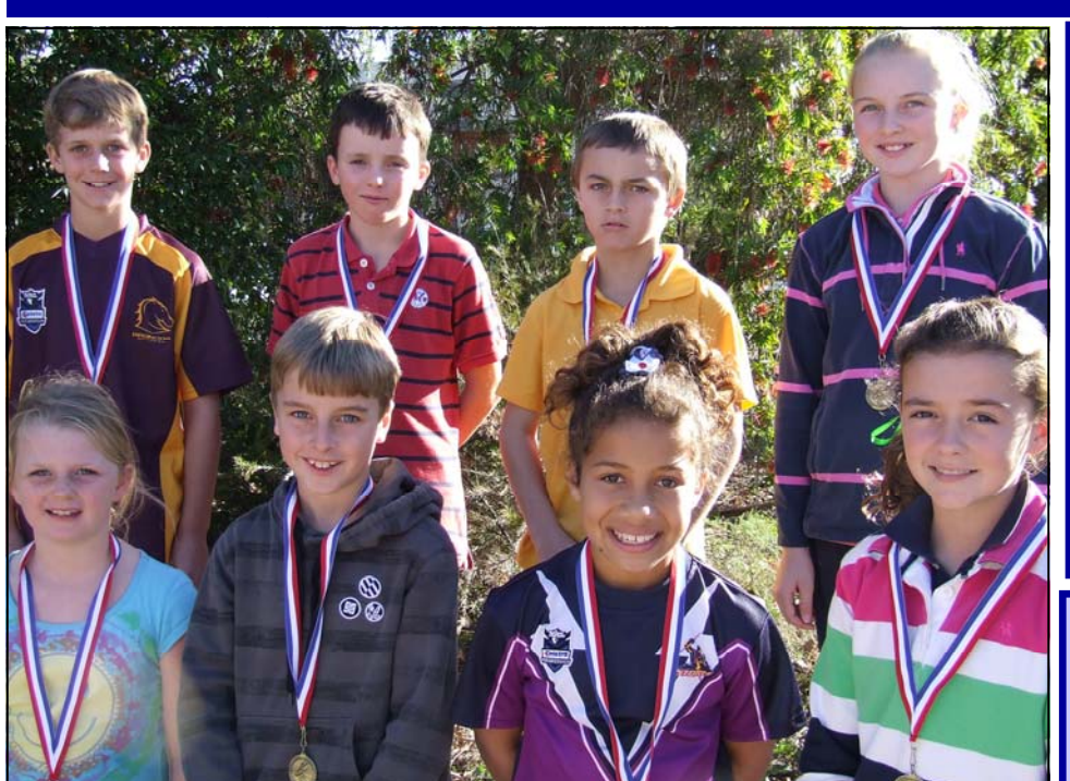
2013 Cross Country Champions