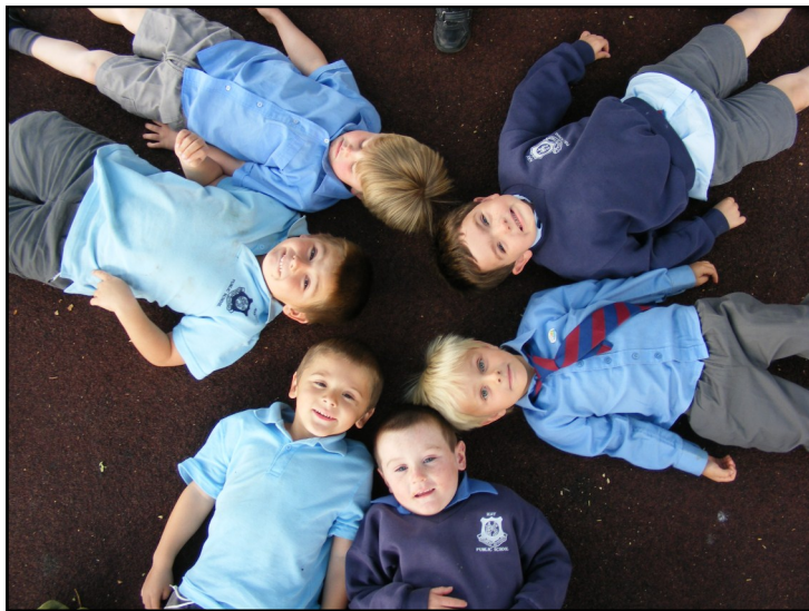
Kindergarten Red on a 'Chester' adventure