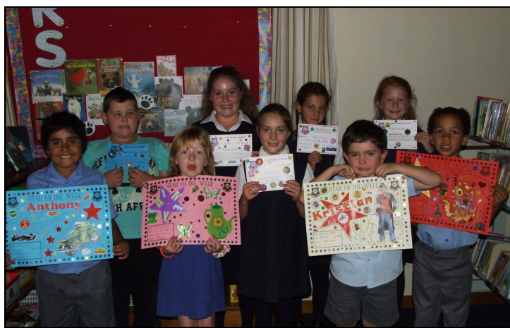
Stars and Pupils of the Week