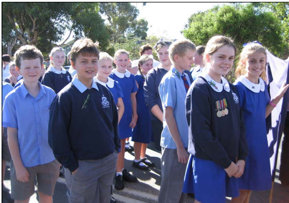
ANZAC DAY 2013