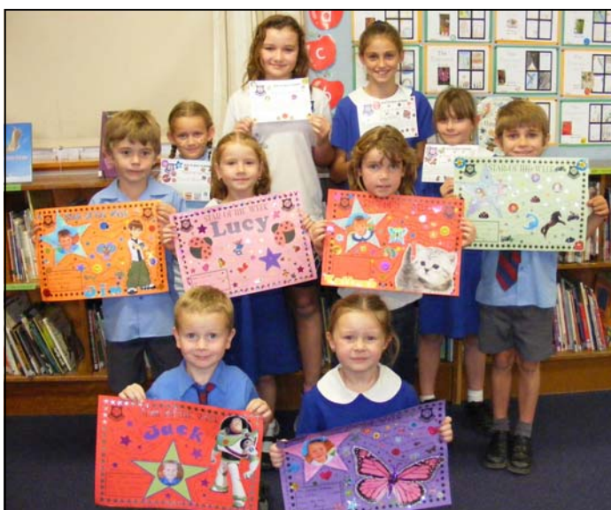
Stars and Pupils of the Week