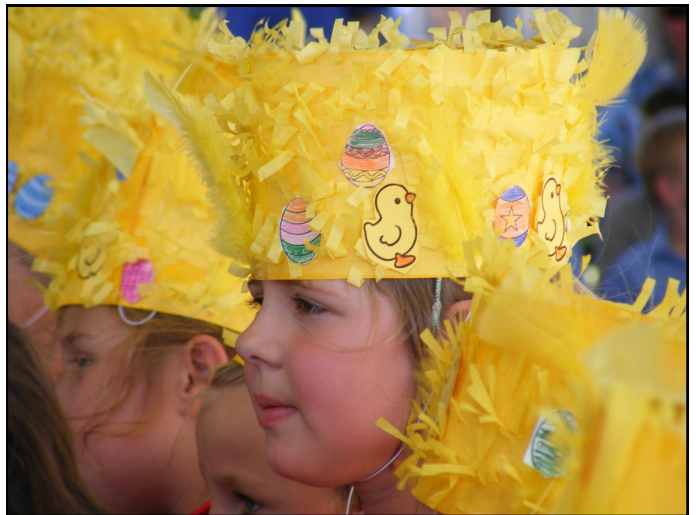
Wonderful plumage at the Easter Hat Parade

The NSWPPSA Girls' Soccer Championships will be held at Wyong from 28 th – 30 th May (Term 2, Week 5).