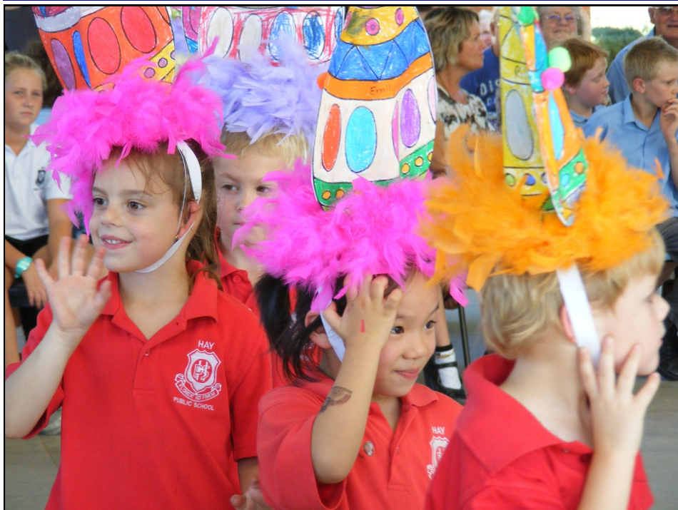
Kinder Red displaying their Easter Bonnets