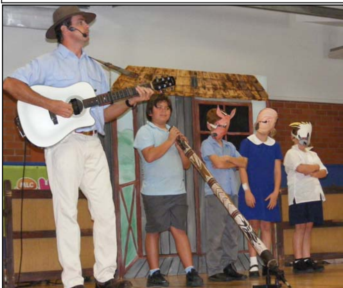
Australian Folklore Performance. K-6 enjoyed a rollicking afternoon.