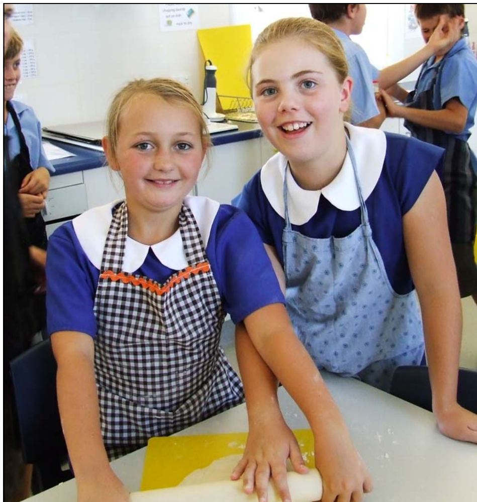
5/6 Blue in the Kitchen