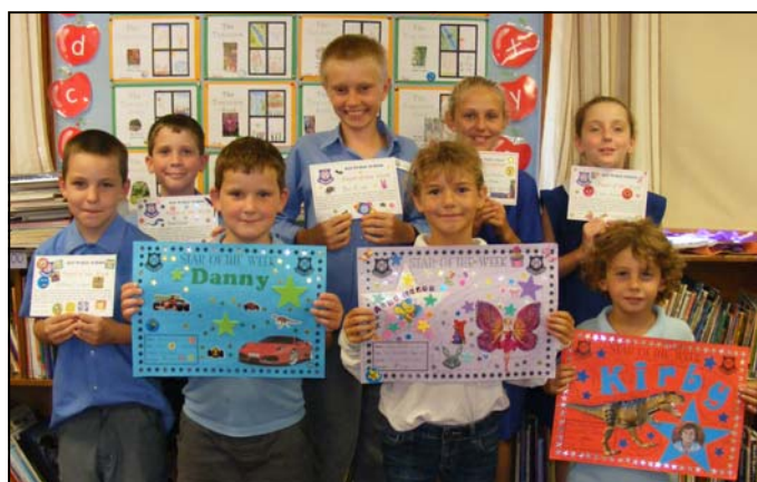
Stars and Pupils of the Week