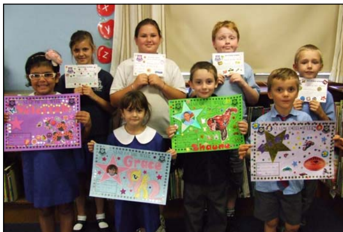
Stars and Pupils of the Week