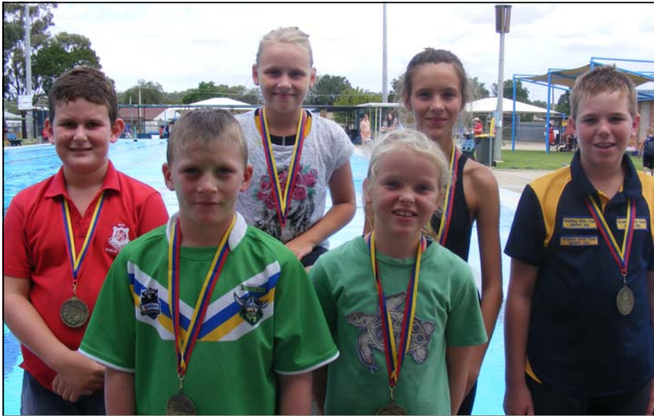
Swimming Champions for 2013