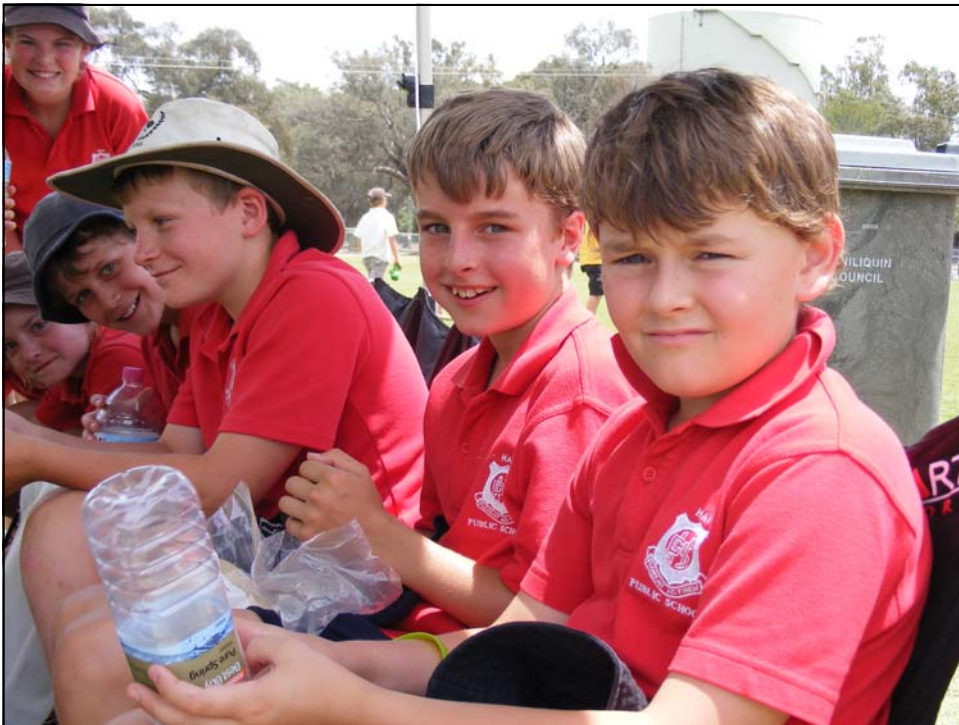
Stage 2 at Super 8's Cricket