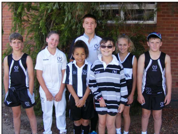
Riverina Representative Photo-

Rotations will continue this week, with the focus on Super 8's cricket.