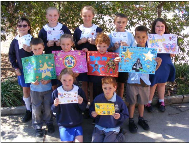
Stars & Pupils of the Week