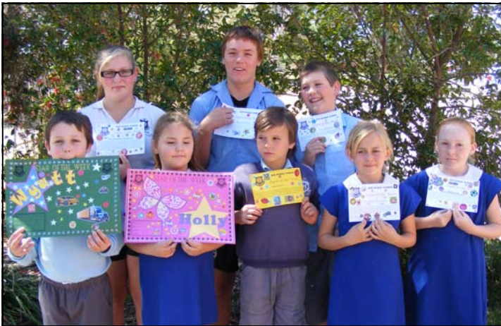
Stars & Pupils of the Week