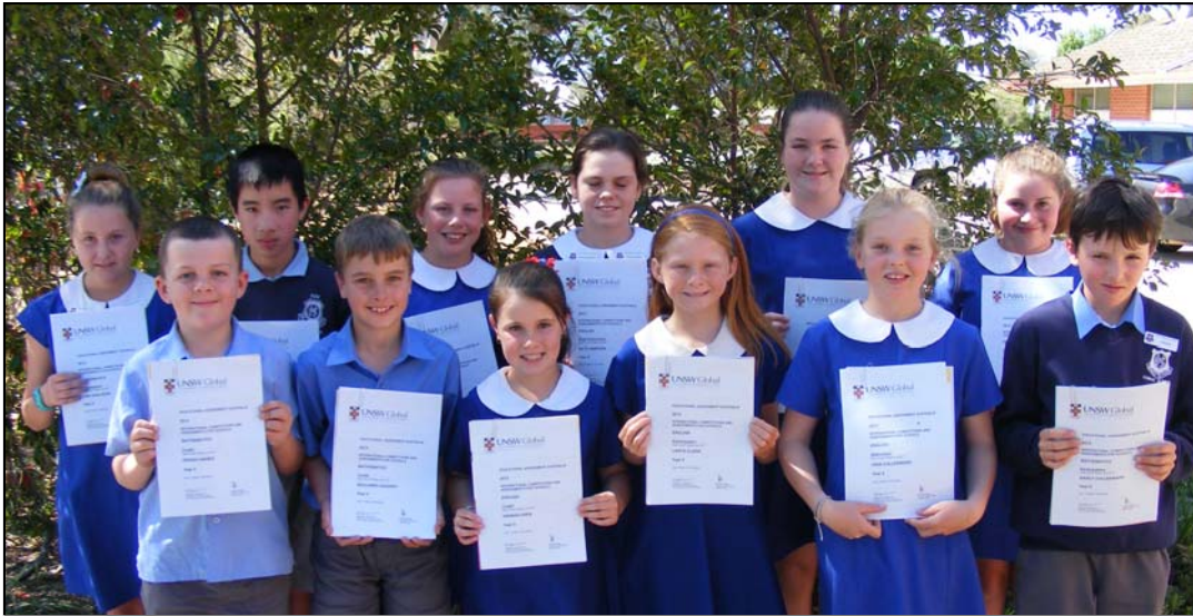
University of NSW Participants

Assembly Friday 2:15pm School Hall All Welcome