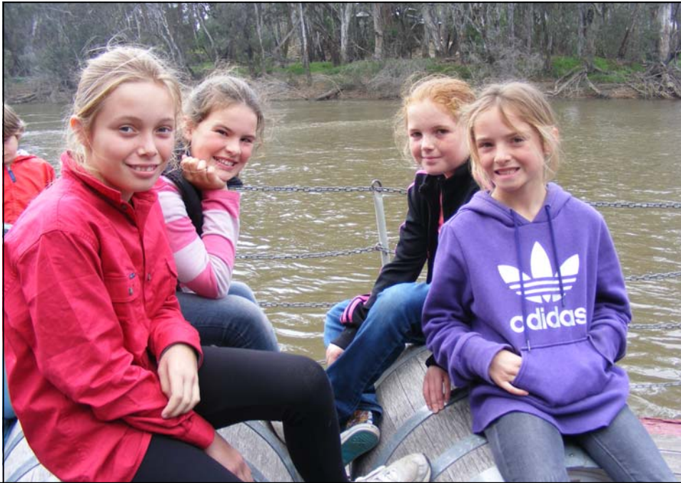
Stage 2 Excursion—Billabong Ranch, Echuca