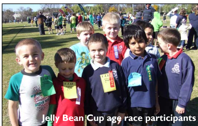
Jelly Bean Cup age race participants

Parental assistance would be appreciated.