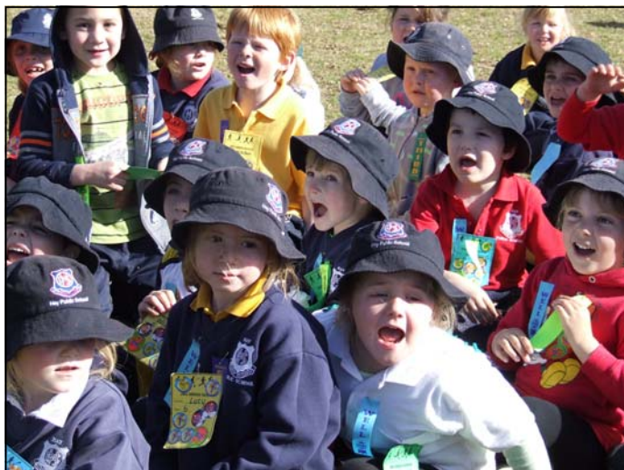
Jelly Bean Cup cheer squad