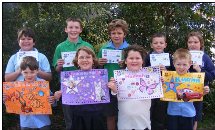
Pupil and Stars of the Week