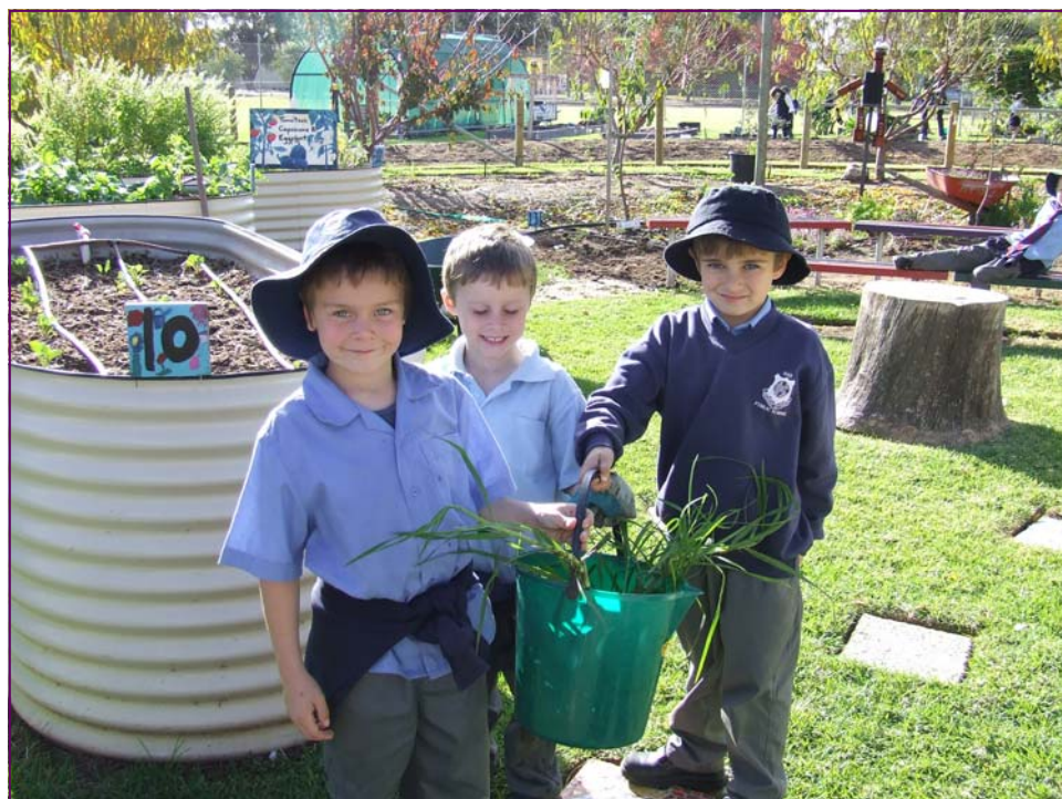
ICR in the Garden