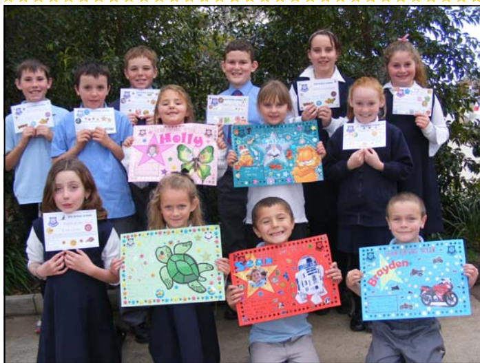
Pupil and Stars of the Week

Teddy Bears' Picnic invitations have been sent to children who have nominated to attend Ready, Set, Kinder.