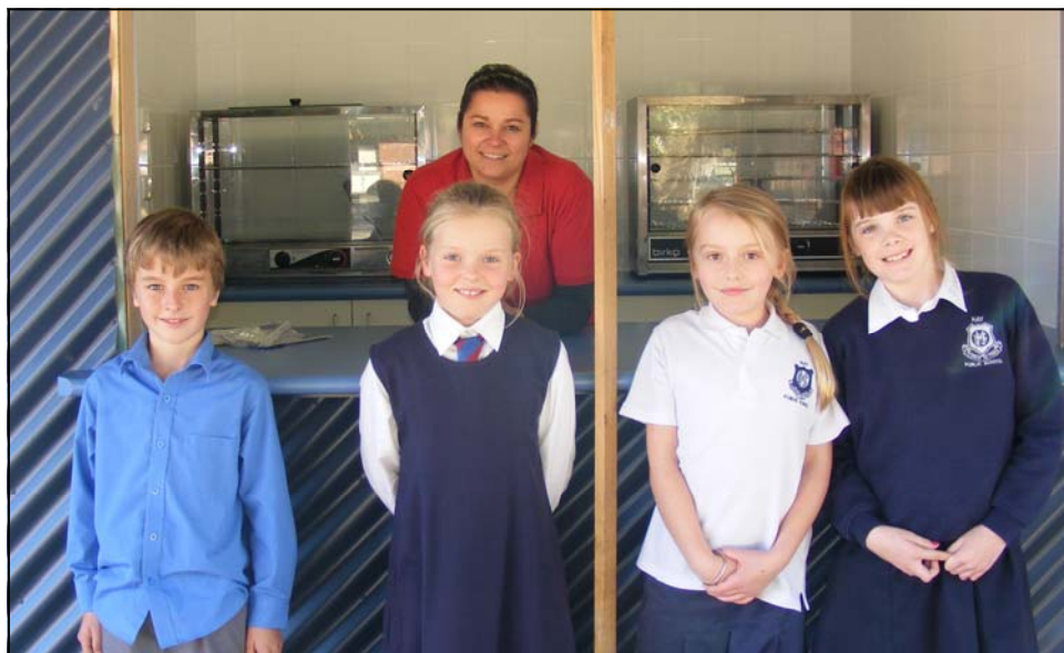
Our 'nearly finished' canteen