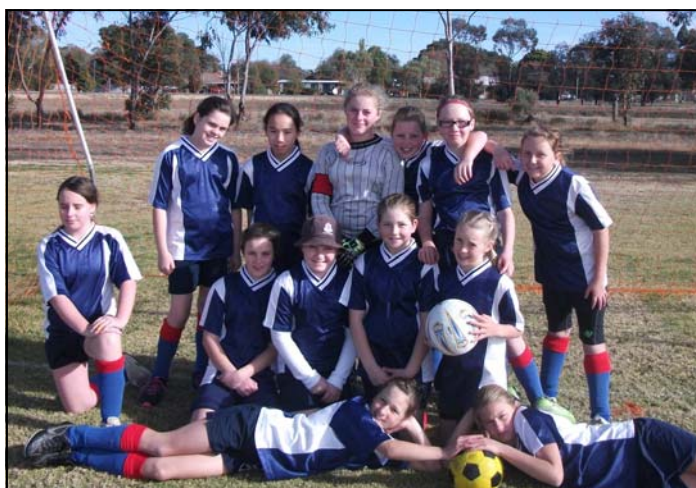
Girls Soccer team