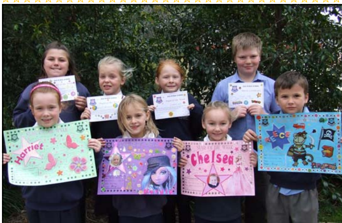
Pupil and Stars of the Week