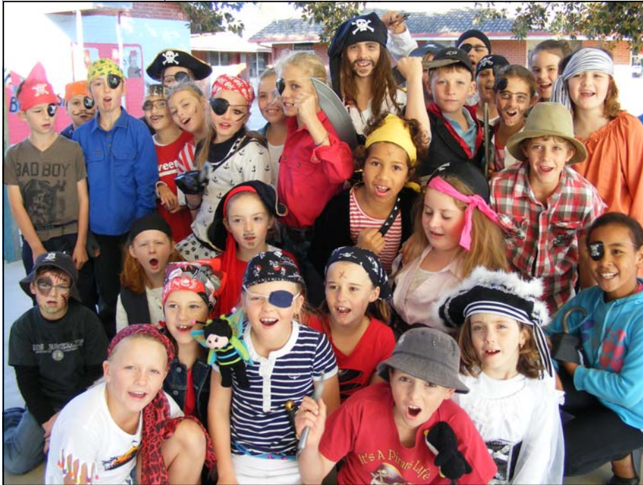
Pirates of the Murrumbidgee