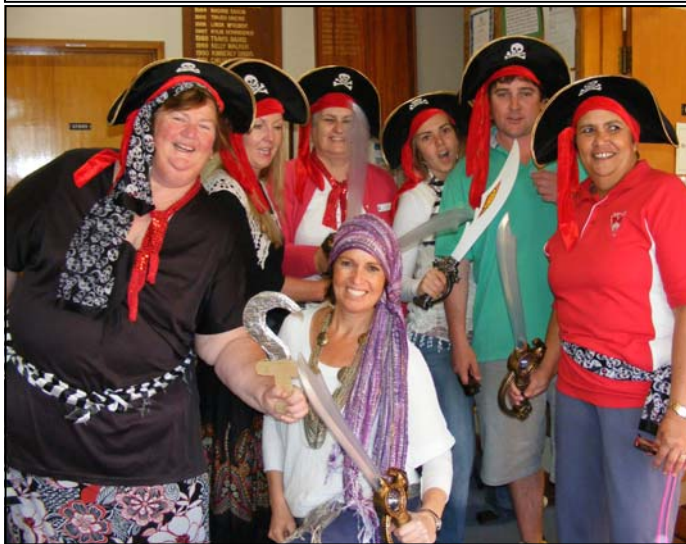
Staff at HPS in the groove for our 'Pirate Fete'