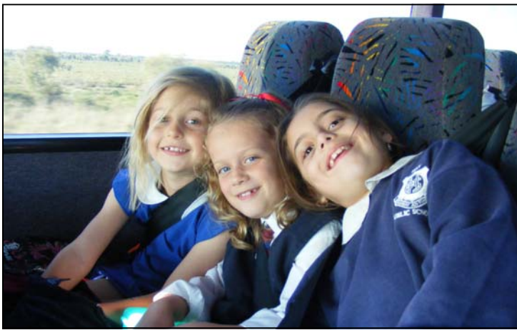
On the bus to Griffith for their Stage 1 Excursion