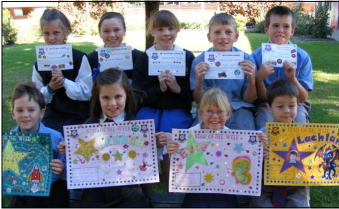
Pupil and Stars of the Week