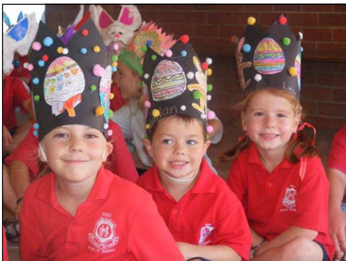
Easter Hat Parade