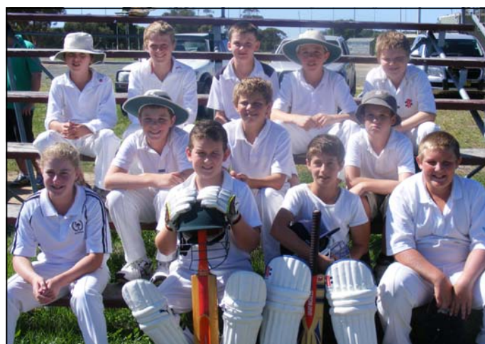
Hay Public School cricket team