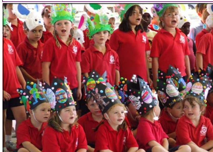
Performing at the Easter Hat Parade