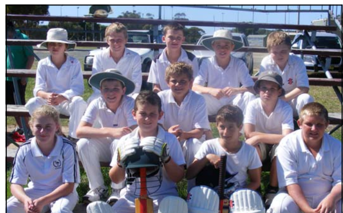
HPS Cricket team.