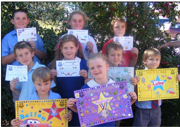
Pupil and Stars of the Week