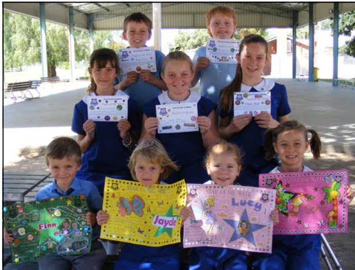
Pupil and Stars of the Week