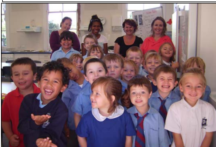
Kindergarten in the kitchen

PUBLIC FLOOD MEETING TONIGHT AT 6PM IN MEMORIAL HALL, LACHLAN ST (ACROSS FROM THE SCHOOL)